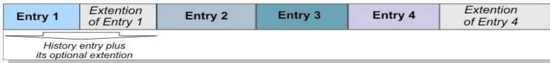
Figure 1: Binary data construction

The history data packet contains a queue of single history entries. Each of this entries can (but must not necessarily) have an extension, which is illustrated in the following picture. However, a packet may contain up to 4 different entry types.