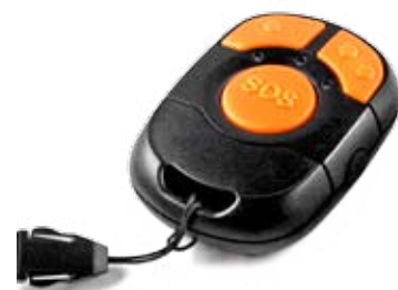
Keyfob extension IEEE 802.15.4 option required